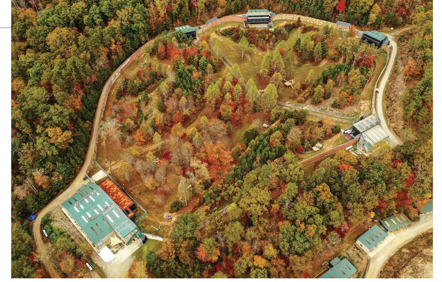
Project Chimps's large, lush outdoor habitat has been one of its main selling points—and one of its biggest sources of controversy.

Halloran says, are evolving from rescue organizations into more sophisticated operations that realize that an "evidence-based way of doing things is critical to providing good care."